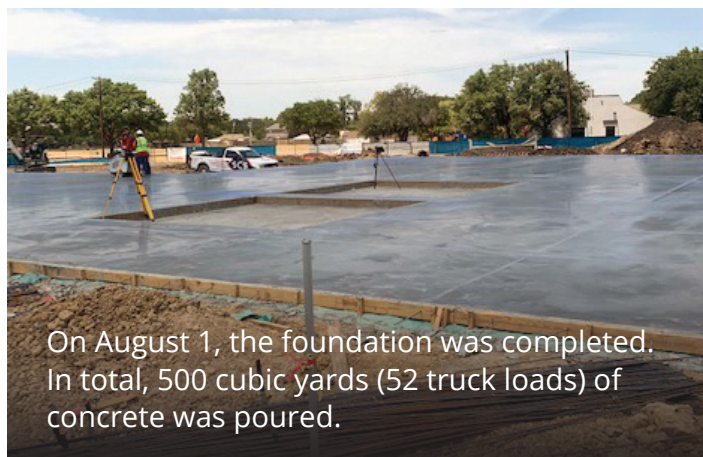
On August 1, the foundation was completed. In total, 500 cubic yards (52 truck loads) of concrete was poured.